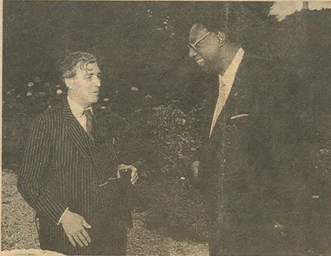
Lord Sudeley, King Kigeli V of Rwanda.